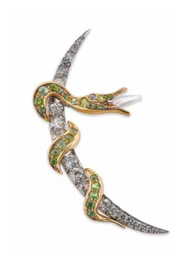
JEWELLERY Lots 1 - 285